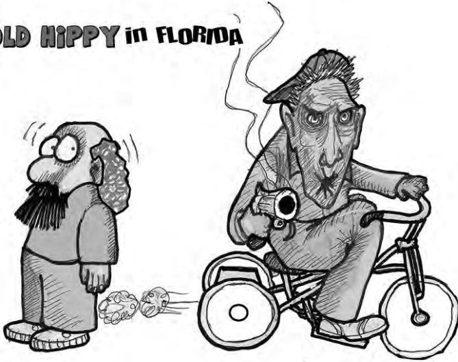
I just witnessed a drive-by shooting by an adult on a tricycle.