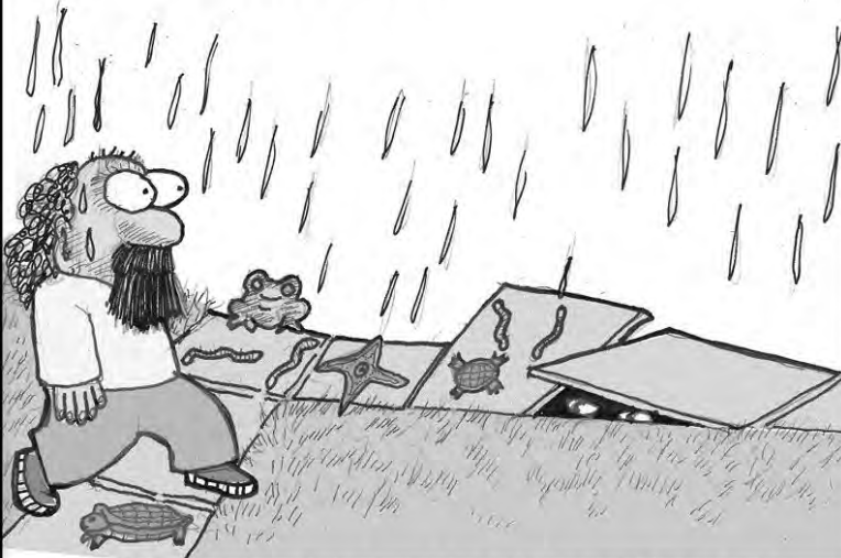
After a rain, you never know what will emerge from the sidewalk.